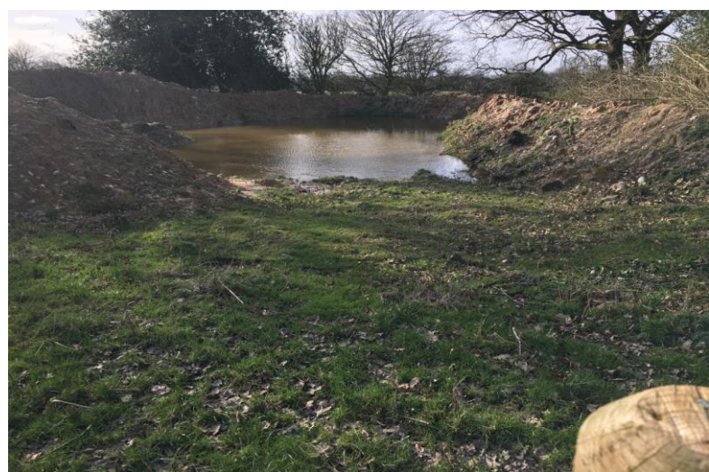
26 th February 2022