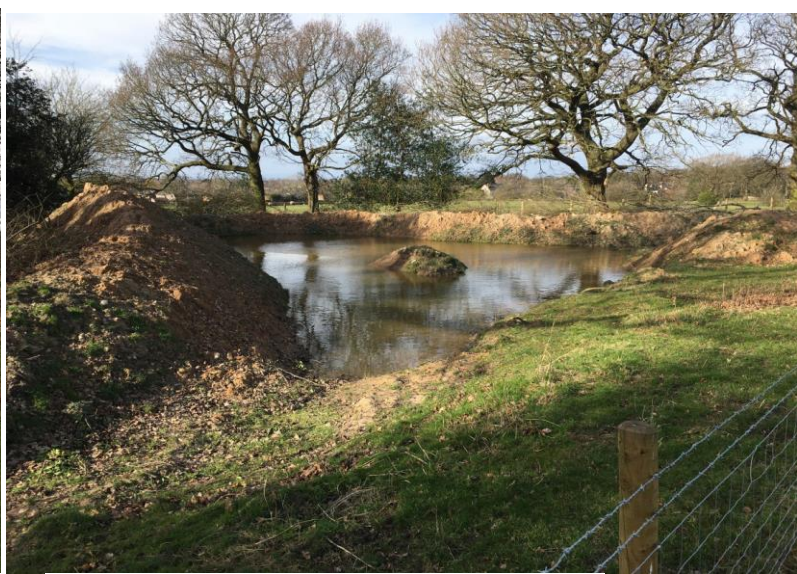
26 th February 2022