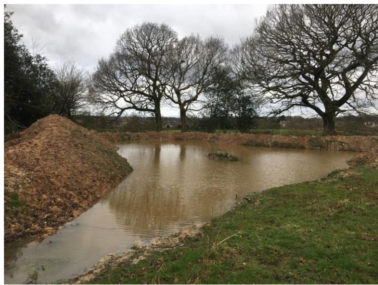
22nd February 2022

As a reminder we now have the aforementioned intervention, those at the Gables, Higher Poynton, and those around Middlecale Farm. We will have photographs of those in operation for future updates. But we can and would like to do more, and we would encourage anyone with land who could help to get in touch. It doesn't have to be much, possibly the old corner of a field that we could add a pond or bund too to temporarily store more water in.