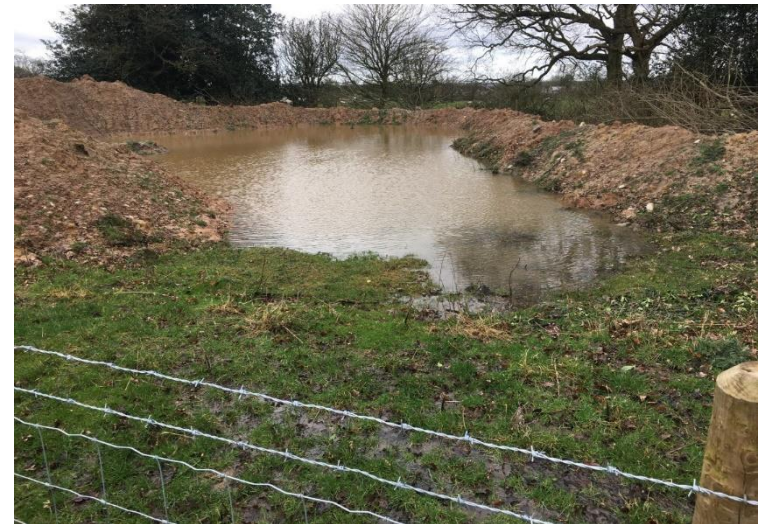
22 nd February 2022