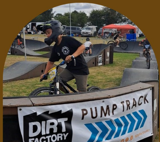
PUMP TRACK FOR ALL AGES