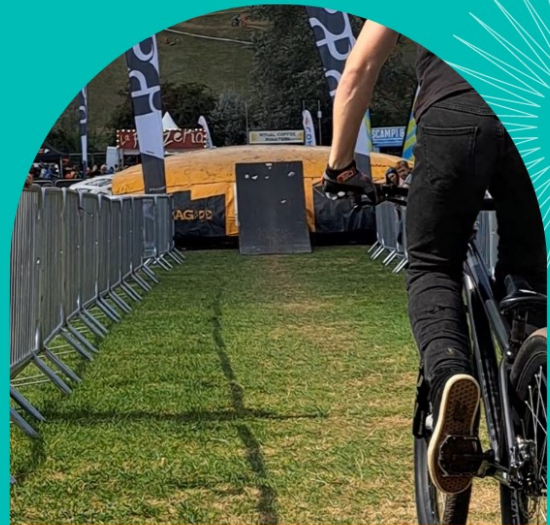
AIR BAG JUMP FOR AGES 10+

Under 12's must be supervised by an adult. A limited number of bikes and helmets are available, please bring your own equipment if possible. See you there.