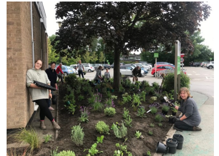
Images showing before, during and after the planting