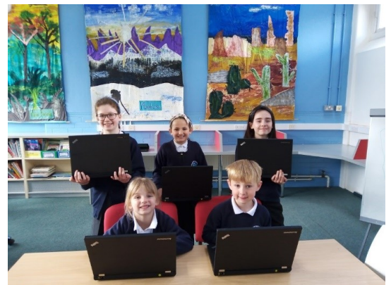
Vernon Primary School children admiring the laptops to be used for home schooling