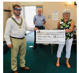
Poynton Mayor and members of Poynton Golden Memories

The Heritage Garden group were awarded £300 towards new plants for the area.