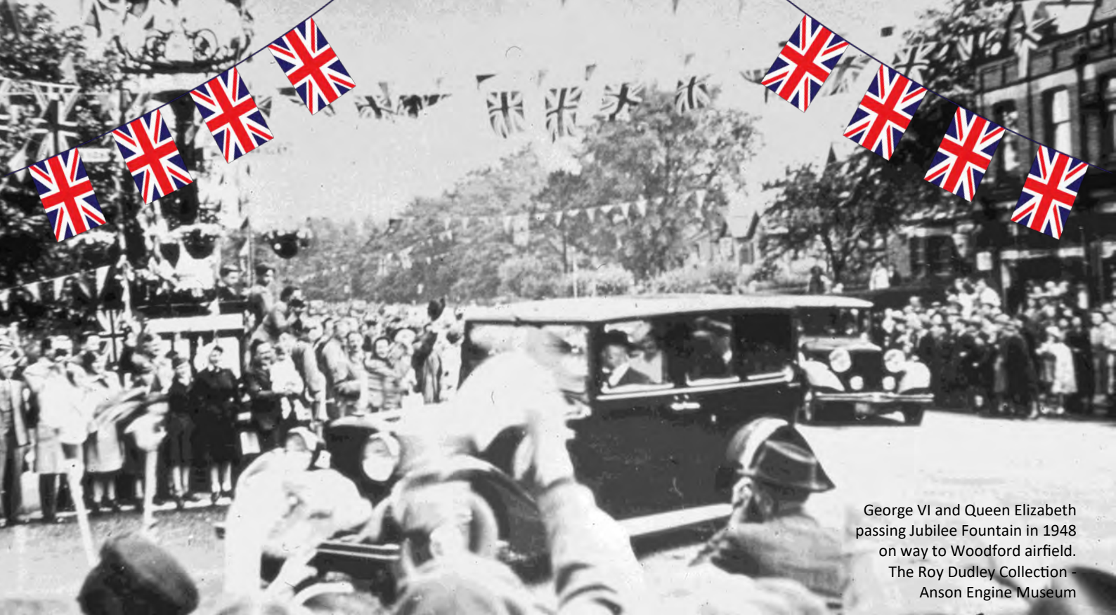
George VI and Queen Elizabeth passing Jubilee Fountain in 1948 on way to Woodford airfield.