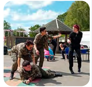
The Boaty Theatre Company: an Ellesmere Port-based company performed a modern version of Shakespeare's ' Much Ado About Nothing' in the grounds of Vernon Junior School.