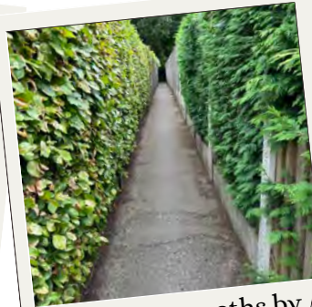
Tidying up paths by cutting back