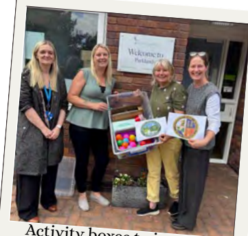
Activity boxes to improve mobility - for residents at local care homes