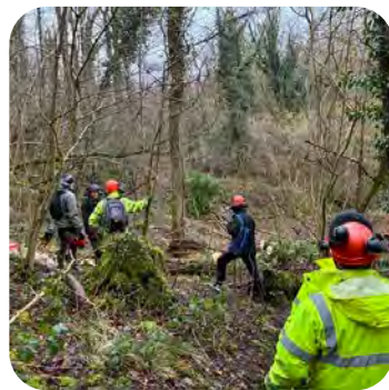
Working with Ranger Ed to improve wildlife areas in Poynton Coppice, e.g. creating butterfly flights.