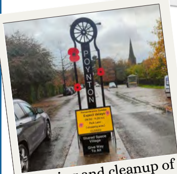
Painting and cleanup of gateways