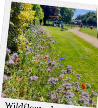
Wildflower border at Brecon Park