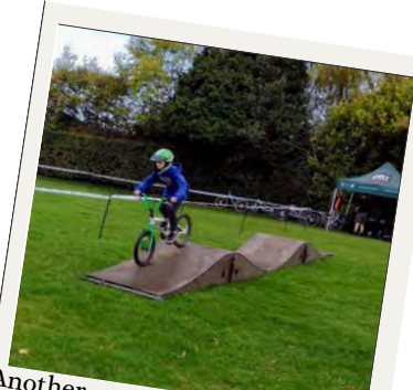
Another successful BMX event as part of the CCST's diversionary activities