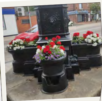
Planting up the Fountain