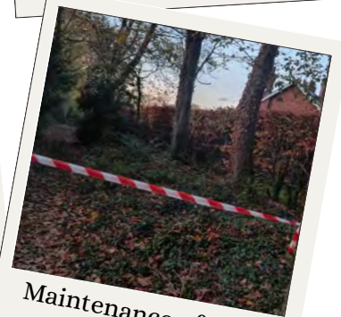
Maintenance of the Inclines