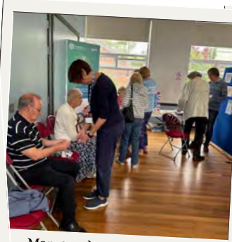
Memory Awareness Event for Dementia Action Week - Heart Heroes blood pressure checks