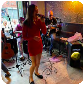
Mambo - Lively Poynton-based latin music trio performed different sets at the opening event at the Snap Tin and later in the week at the Cask Tavern