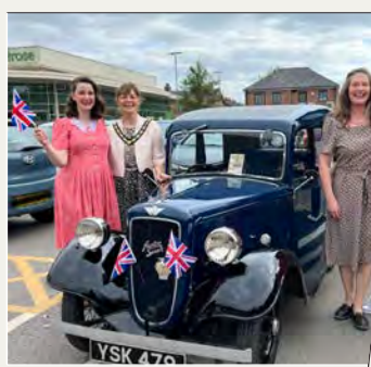
VE Day 80 party at the Civic Hall