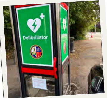
Cleaning up assets