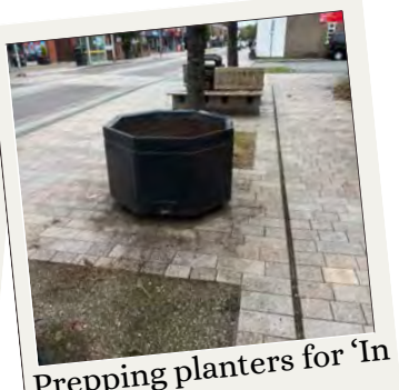
Prepping planters for 'In Bloom' groups