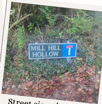
Street sign cleaning