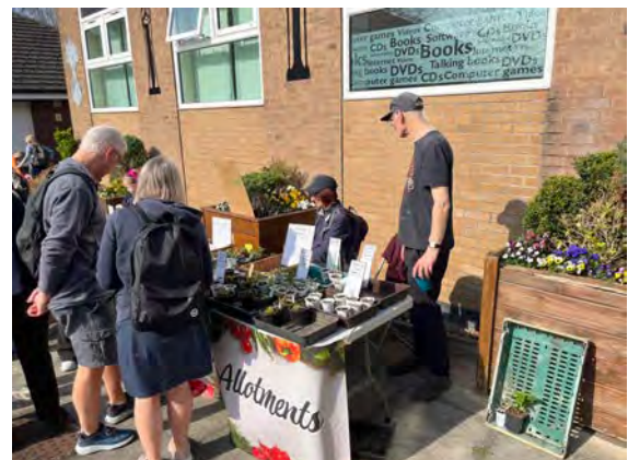
A busy Saturday morning at the well attended Seed /Plant Swap in March