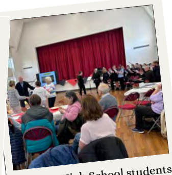
Poynton High School students performing at the Concert to Remember alongside dance and performance from care home residents.