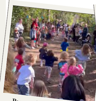
Bunny hop race at the Easter Egg Hunt