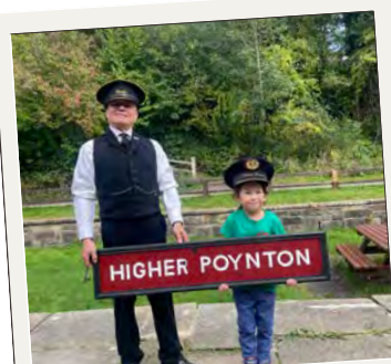
Pop-up platform at Higher Poynton as part of Railway 200 celebrations