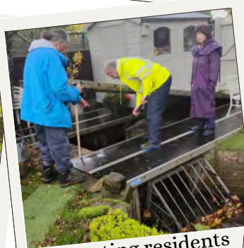
Supporting residents with sluice clearance