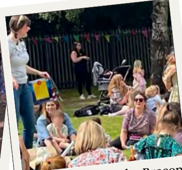
Storytelling at the Brecon Park Teddy Bear Picnic