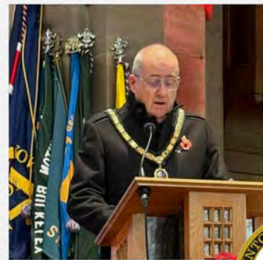
Remembrance Sunday parade and service