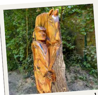
Organising a new wood carving on the Inclines