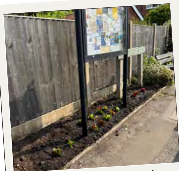
Planting up and keeping the Town pretty