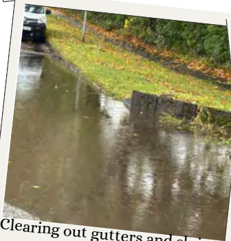
Clearing out gutters and sluices to prevent/clear surface water flooding