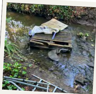
Fly tipping clearance