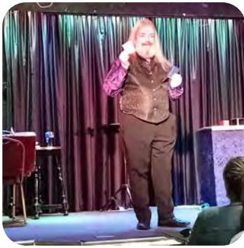
The Order of the Magi, Manchester's oldest magicians' collective performing at the Royal British Legion.