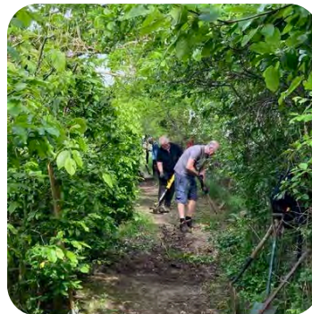
Cutting back and relaying stone on foot path 33 between Hope Lane and Dickens Lane.