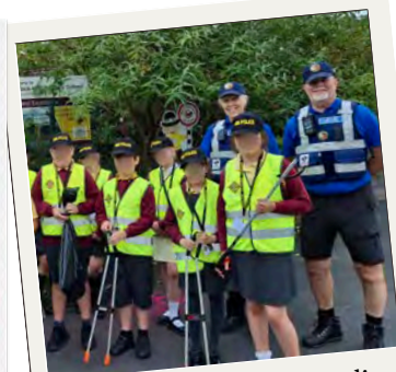
CCST support the Mini Police scheme with local policing unit.