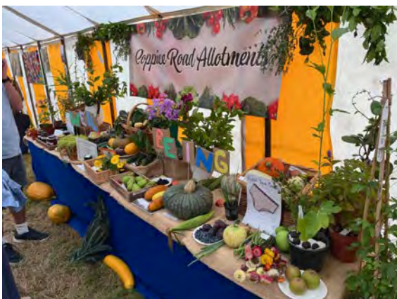
Poynton's allotments enjoyed prize winning success at Poynton Show in August.