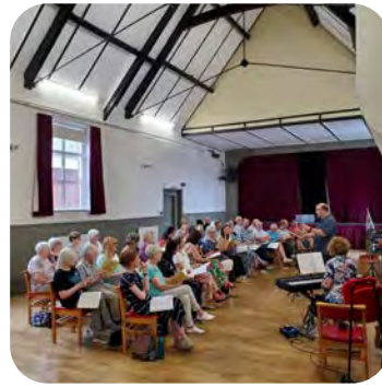
Poynton Gilbert & Sullivan Society - their workshop at The Centre in Poynton is a regular fixture at PAF, with the '25 festival being the turn of 'Iolanthe'.