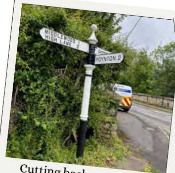
Cutting back overgrown bushes to keep signs visible