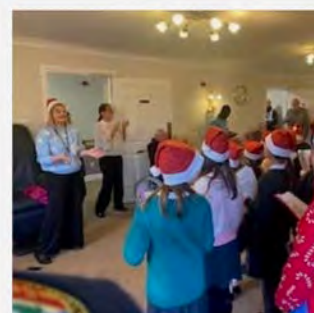
CCST Intergenerational event: schools sing carols at local residential apartments