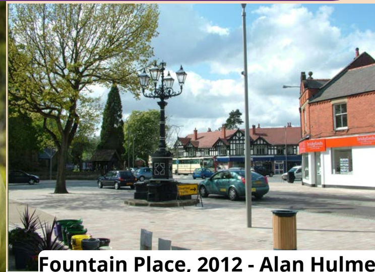
Fountain Place, 2012 - Alan Hulme