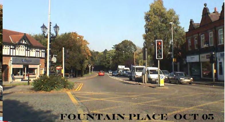
FOUNTAIN PLACE OCT 05