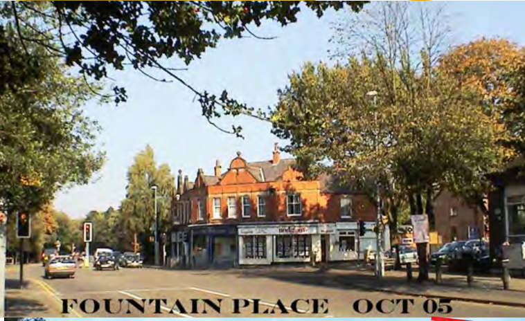
FOUNTAIN PLACE OCT 05