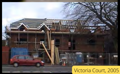
Victoria Court, 2005