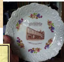
Above - Co-operative Society Jubilee Plate, 1911 Alan Hulme