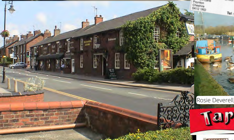
Rosie Deverell, 2008