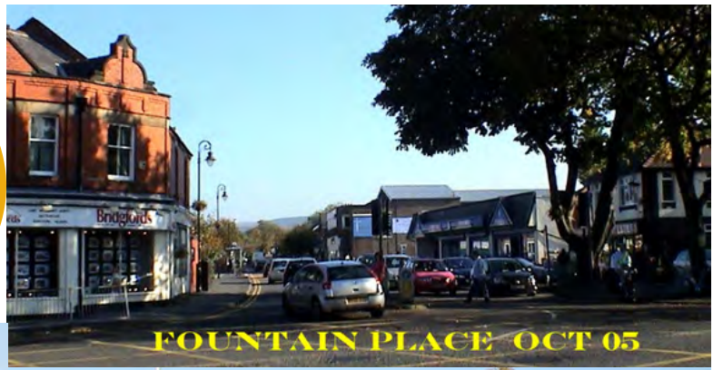
FOUNTAIN PLACE OCT 05