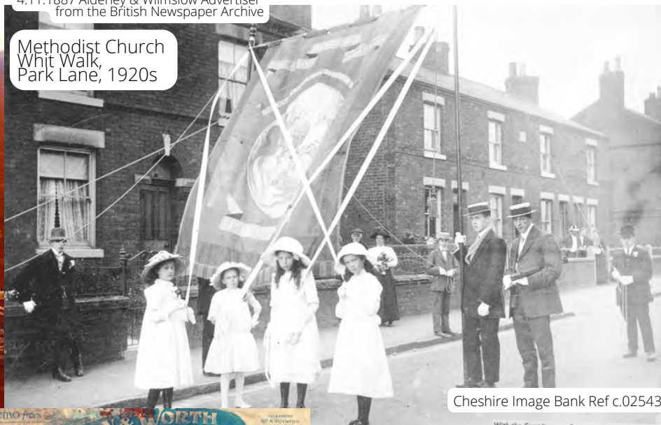
Cheshire Image Bank Ref c.02543