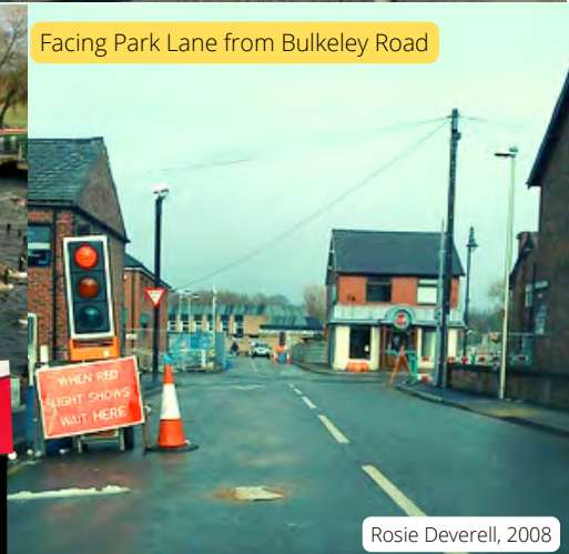
Facing Park Lane from Bulkeley Road