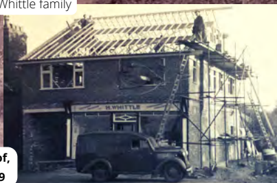
View from Whittle's shop roof, up Coppice Road, during building works in 1959