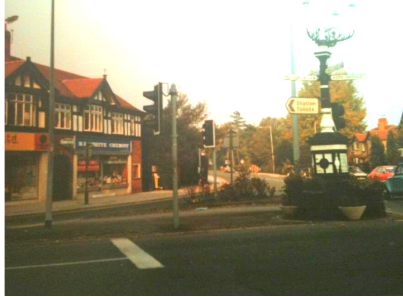
1981 - Fountain Place - Kath Marshall