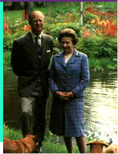
Illustrated London News 7th July 1986

Prince Charles married Lady Diana Spencer in 1981 and street parties were held up and down the country to celebrate the occasion. Prince William was born in 1982 and Prince Harry in 1984. The Queen made historic trips to Vatican City in 1980 to meet the Pope and to China in 1986. She also forged a great friendship with US President Ronald Reagan in the 1980s.