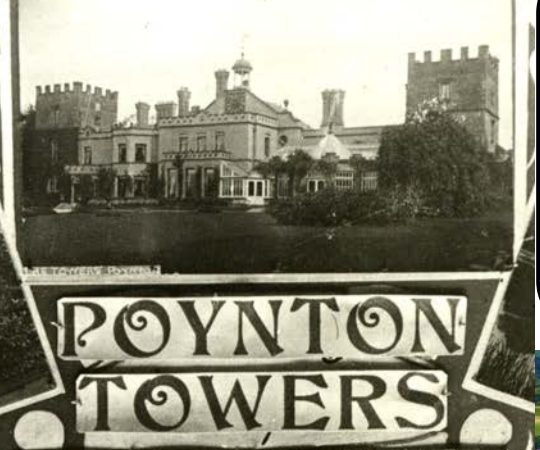
Poynton Towers postcard 1900-1909

Now you know how Towers Road got its name!