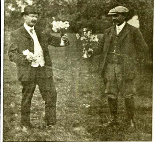
JUDGING SWEET PEAS AT POYNTON SHOW. 1911