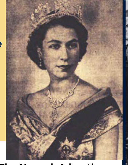
The Newark Advertiser, 3rd June 1953

making, the extraction of sand and gravel and textile making.